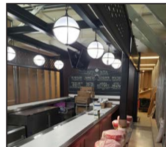
Hubbard Inn brings a taste of the River North area to Concourse B later this month.