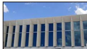
Clerestory windows will fill the pavilion with natural light.